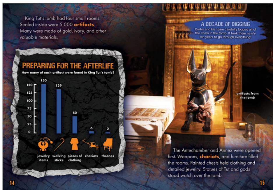
Sample spread from King Tut's Tomb